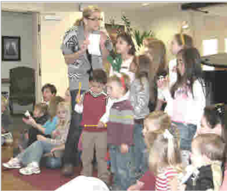
Children's Ministry, Senior Adult Ministry (SAM) and the SHPC Preschool joined together for a day of caroling at The Emeritus. Voices were lifted high and good fun was had by all!