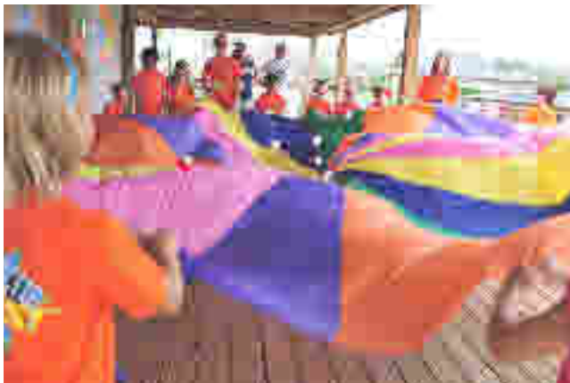
Rain doesn't stop Rocket Rec!