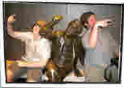
HAVING FUN WITH ALBERT EINSTEIN AT THE GRIFFITH PARK OBSERVATORY IN LOS ANGELES CALIFORNIA!