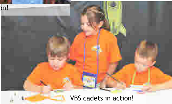
VBS cadets in action!

Overall, it was an amazing week that the kids should remember for a long time to come!