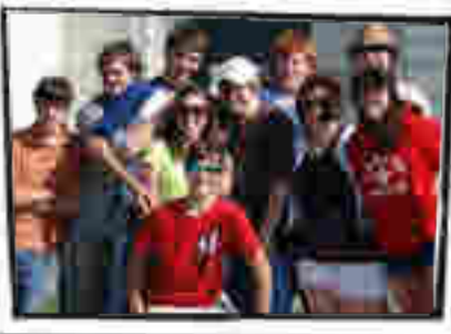
AMAZING TRIPS EVERY YEAR! LAST YEAR WAS DCLA! This year I hear we are heading to, Mo Ranch, Los Angeles, and Guatemala!