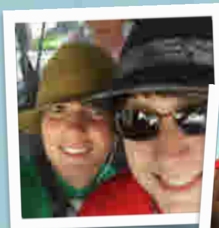
EverDeep- High School Super Studies 8:15 pm till way late