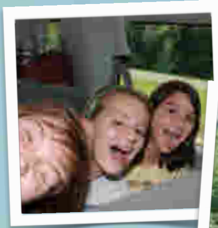
We do a lot of building stuff at Evergreen and Evermore, including building our students' faith

Evergreen is for 5th & 6th grade students at 6-7 pm. Evermore is for 7th & 8th grade students and meets from 7:15- 8:30 pm