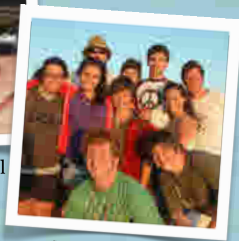
EverLast High School Nights 6-8 pm

outlook on everything in life. We would love to be a part of your journey through high school. Here are just a few of the ways that you can get connected and plugged into our groups. Consider hanging out at our EverLast