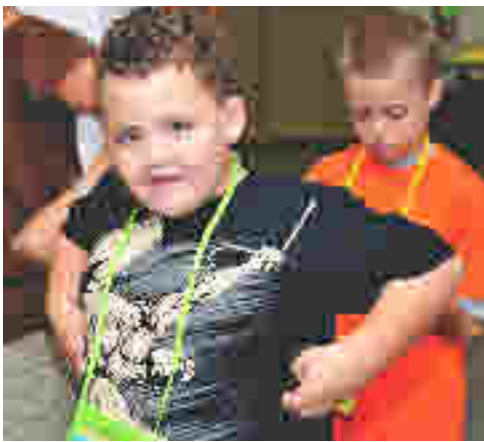
Oooh, oooh, ooh—"Matilda the Gorilla" gets us giggling every morning