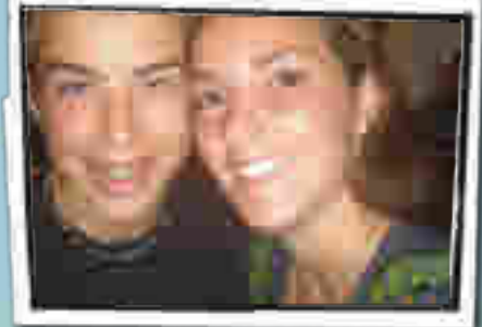
SUMMER CAMP WAS AMAZING! GREAT ESCAPE CHANGED MY LIFE AND AT FUN IN THE SON PADRE I GREW DEEPER IN LOVE WITH JESUS!